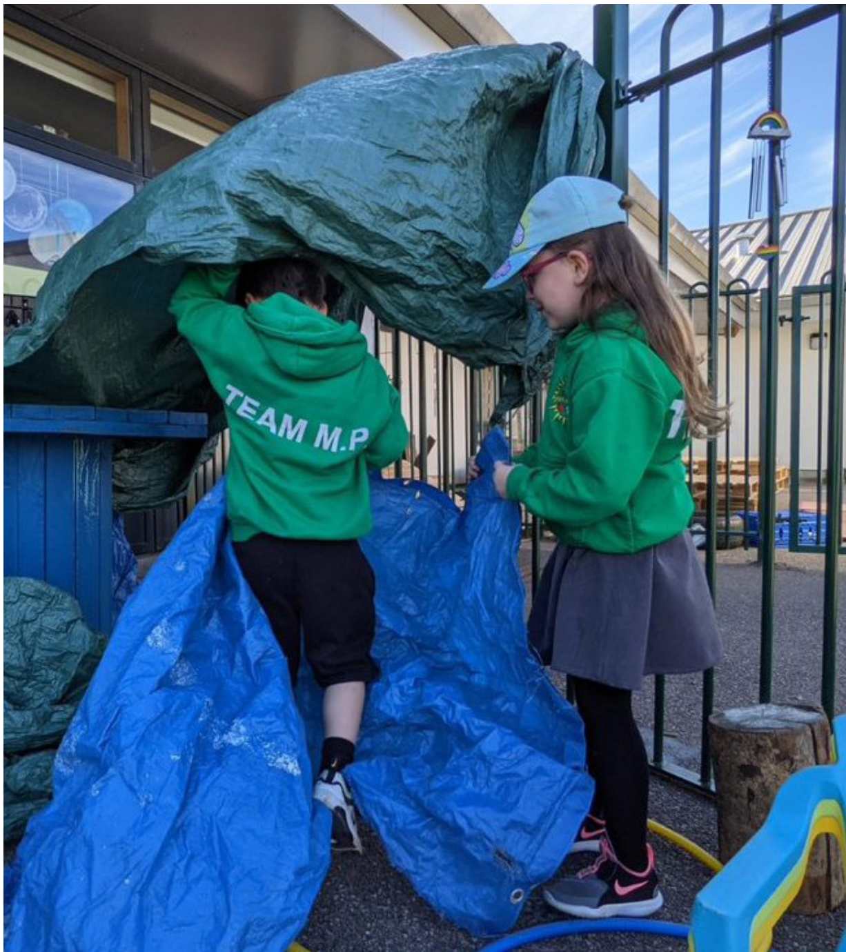
Images: Playing outside and Den building with girls and boys

We conclude with some reflections on the work and with calls to action .